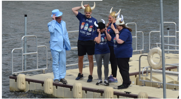
Our Osseo team BEFORE the jump....