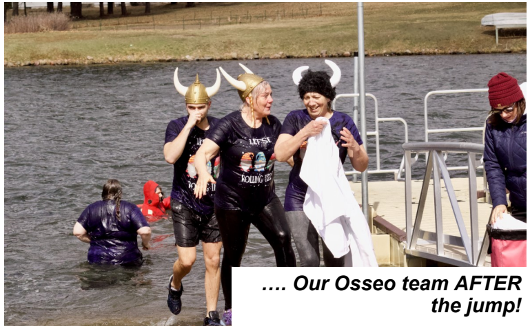
.... Our Osseo team AFTER the jump!